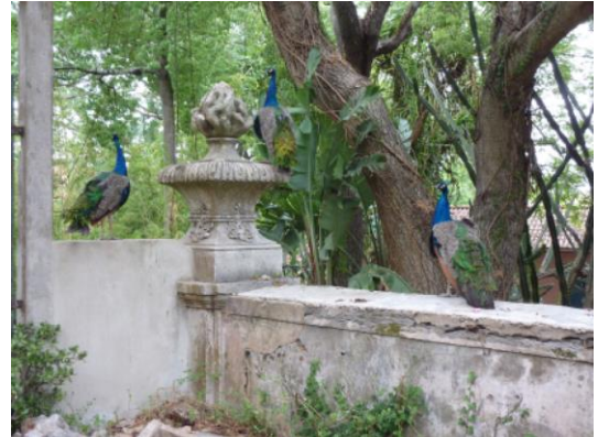
Shelagh Keeley, film still from The Colonial Garden / Jardim do Ultramar Lisbon , 2016

Keeley’s MOCA exhibition combines a series of tarp paintings from 1986, a large-scale film projection from 2016, and a new ephemeral wall drawing that she will create on-site over the course of several weeks in January 2020. All three bodies of work are extensions of a conceptual process in which the artist weaves together the past, present, and future. The tarp paintings are shown on the floor and wall, grounding decades of Keeley’s practice within the frame of a particular gallery space. In her new wall drawing, Keeley interweaves photographic traces of the building pre-renovation, creating a poetic and gestural response to the history of the site.