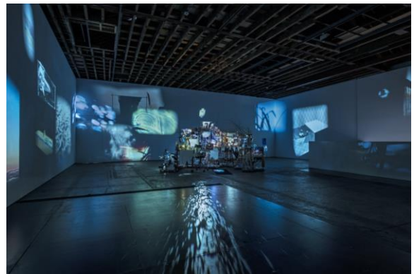
Sarah Sze, Images in Debris , 2018

Simultaneously a sculptural installation and projection tool, Images in Debris lends equal weight to images and objects, exploring the edges between the two and bringing both into dialogue with the surrounding architecture. At its center is an L-shaped desk, inspired by the artist's own studio desk, which, acting like a projector in a planetarium, casts images onto an intricate structure extending from the desktop and across the gallery walls.