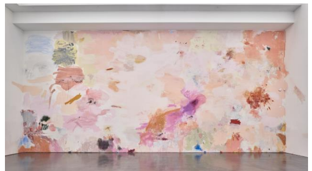
Megan Rooney, Fire on the Mountain , 2019

For the artist’s first major solo exhibition in Canada, Rooney will transform a floor of the Museum by enveloping it in a large-scale mural, making use of all original walls. This temporary, site-specific environment will become home to sculptural characters and scenarios composed from ubiquitous household materials, found objects, stuffed fabric, and paint.