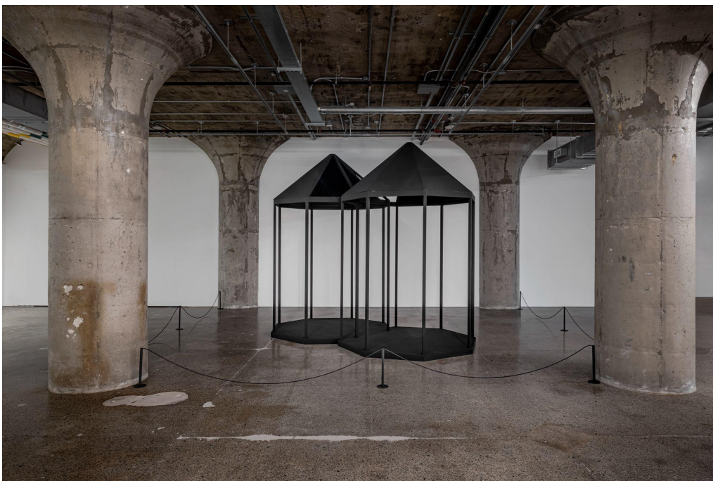
Native Art Department International, Double Gazebo (MOCA), 2021.