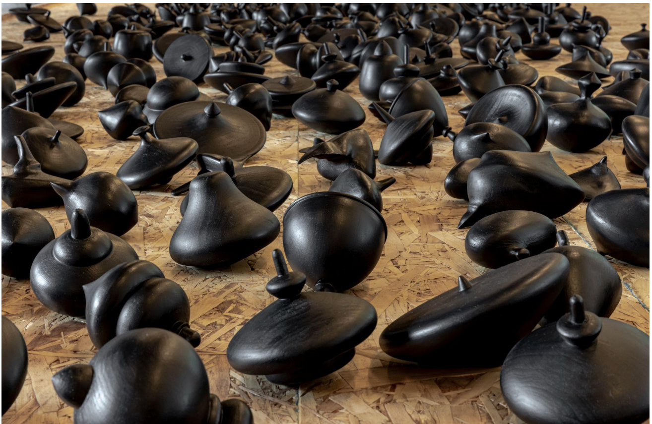
Ghazaleh Avarzamani, Broken Circle , 2021.

Clay Shadows is inspired by Ghazaleh Avarzamani's work Broken Circle in which she explores shape through the shadow of one original wooden spin top. To create this work, Ghazaleh used a digital modeling programme which allowed her to translate 2D shadows into 3D forms. As with Broken Circle , each spin top made will cast a unique shadowed form. Once your spin top is complete, you are invited to test its spinning abilities. Each clay spin top will take approximately 24 hours to dry.